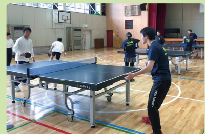
OKB Friends activity for club activity support plan at Special Needs School