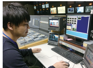
A trainee at a TV station shooting a scene

Our inter-industry training system promotes flexible thinking that is not limited by bank boundaries and that drives us to provide services from the customer's point of view.