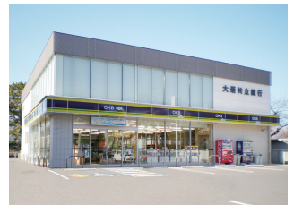
Handa Branch, aka Convenience Plaza Handa, planned by a trainee managing a convenience store